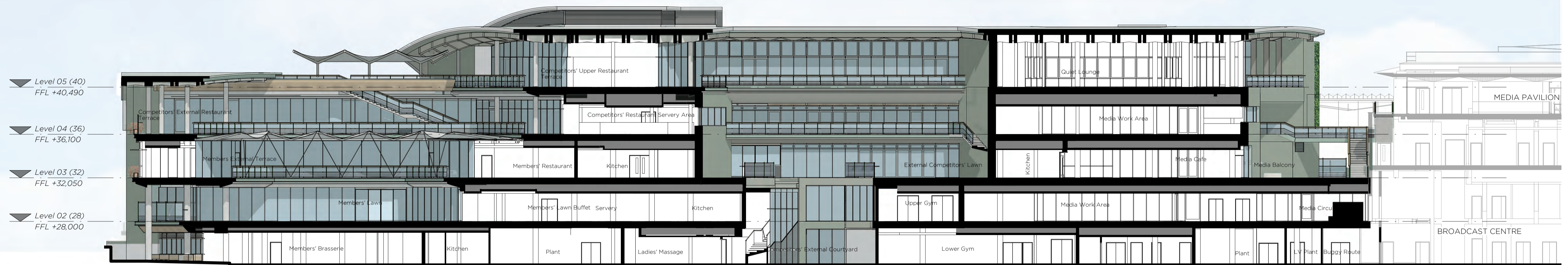
Planning Section FF

DISCLAIMER CAD data is subject to undetectable alteration, either intentional or unintentional, due to, among other causes, transmission, conversion, media degradation, software error, or human alteration. Accordingly, all such data is provided to the parties for information purposes only and not as a record document. It is the responsibility of the user to compare all data with the record copy of the document(s), which would be in paper or pdf format. In the event there is a conflict between the record document(s) and the data file, the record document(s) shall prevail.